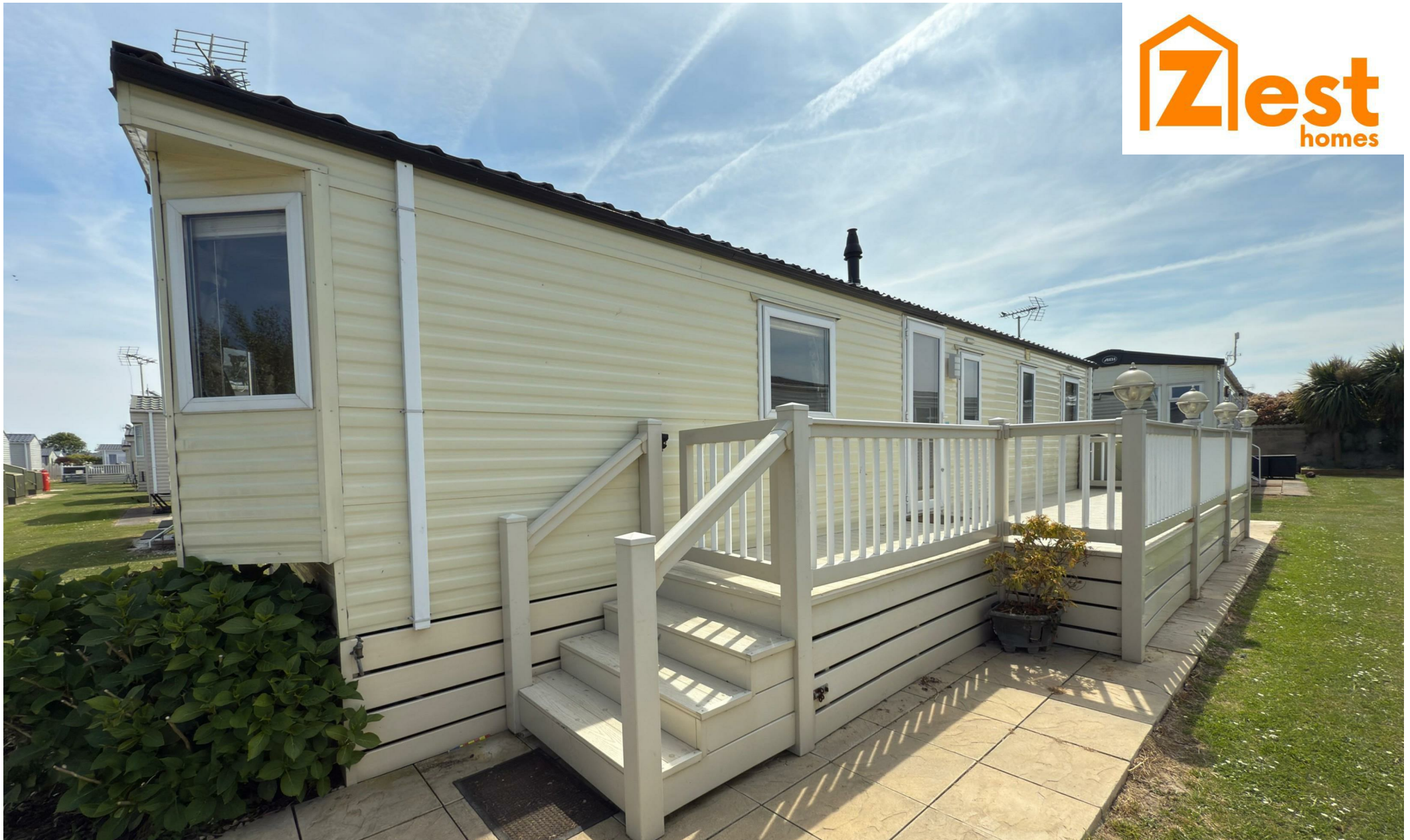
Delta Sapphire, Seaview Holiday Park St John's Road, Whitstable, CT5 2RY £39,995